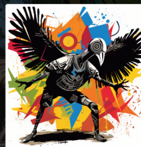
TRANSGIVING FEAST SOO-VEED