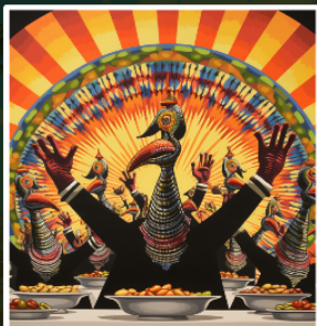
HAMSPORT THE MINISTRY

The Continuum of a musical/ sub-cultural tribe that's managed to hold it together for over 20 years.