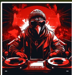
GREASE 2000 THREE DRONES ON A VINYL