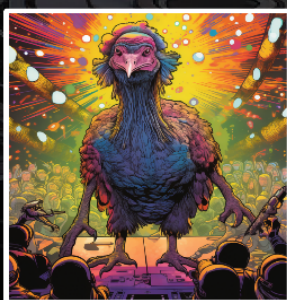
PILGRIM'S PSY XtraSAUCE