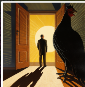
PUMPKIN SPINS PIESTO