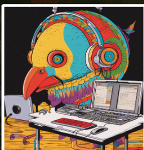
PSYCHO-DELI MEAT LIVE PA F3ATHR