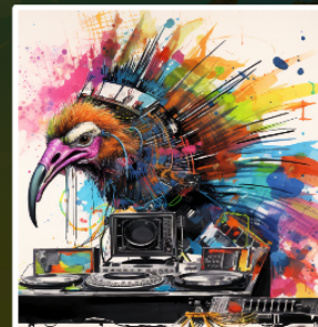
NEOTERIC GRAVY 807MB