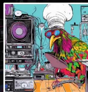
TRANSONIC DELICACIES FEAST FREQUENCIES

DJ TINY PUMPKIN * TURKEY TURK * GRAV-E * WATTLESLAP DJ CORNUTOPIA * THREE MILLION DOLLAR YAM * DJ DARKROUX DJ FRIZZLE * SWAMP GOTHIQUE * PEQUON * HELL & GRAV-E