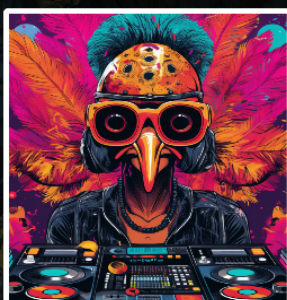
CARVING-KIT-CUTZ GROOKY & THE WALRUS