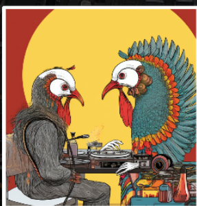
MASHED BEATS BANQUET CUSTARD CUT